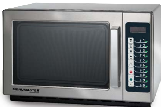
Model MCS10TS shown